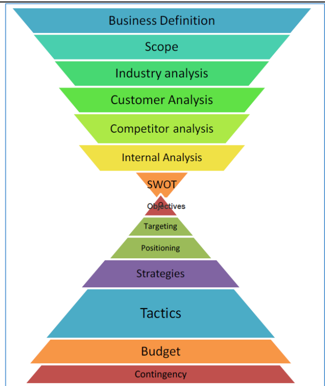
Components of a marketing plan

HOW marketing planning differs at different decision levels???